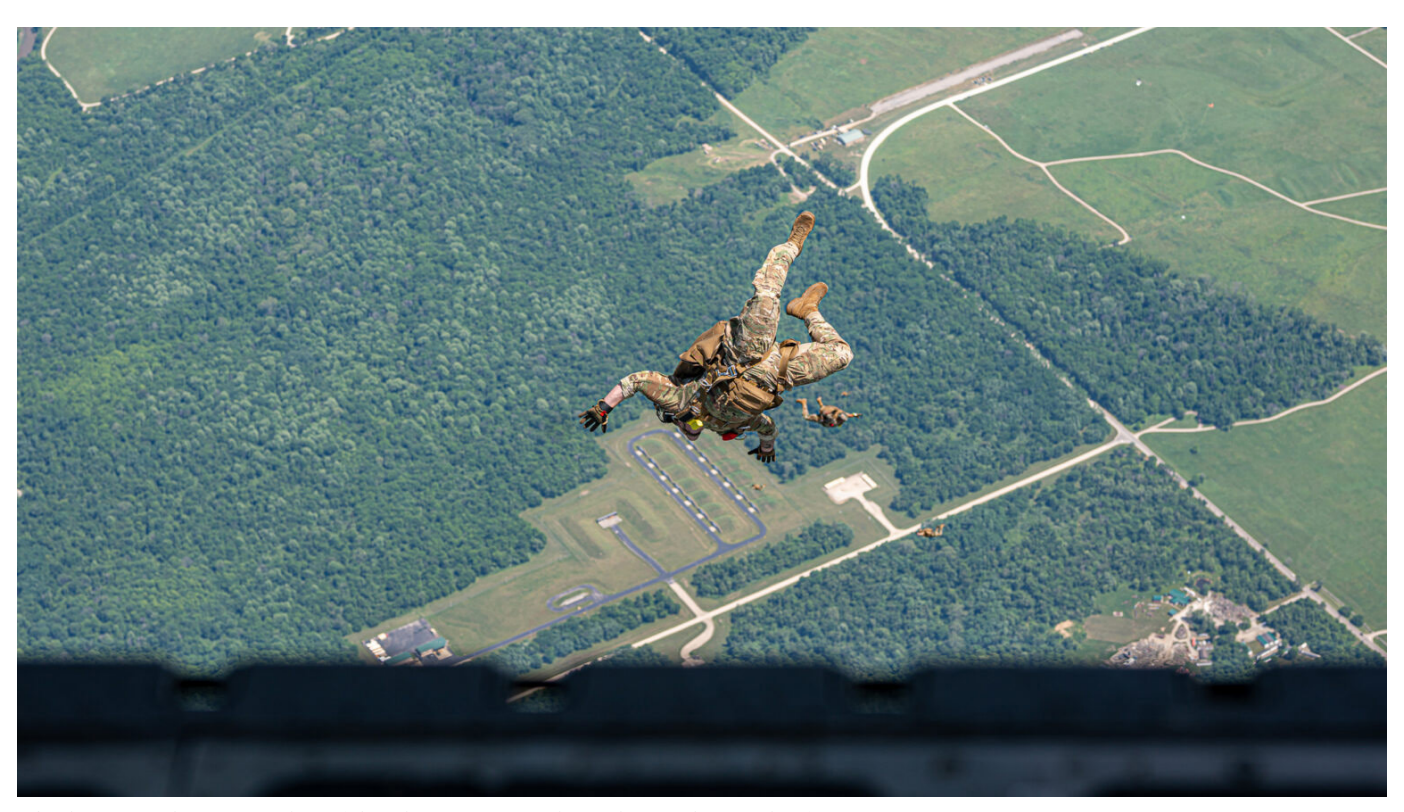
We're diving into the 2022 storylines.

Here's the key Army storylines we'll be tracking at Breaking Defense next year.