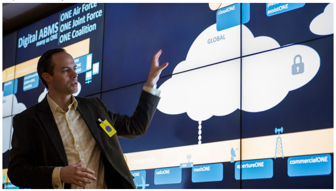
Preston Dunlap, Air Force Chief Architect, briefs Department of Defense senior leaders on how the ABMS works during the first ever ABMS live demonstration at Eglin Air Force Base, Fla., Dec. 18, 2019. (File)

The military focused its efforts on networked warfare and the US government responded to cyberattacks.