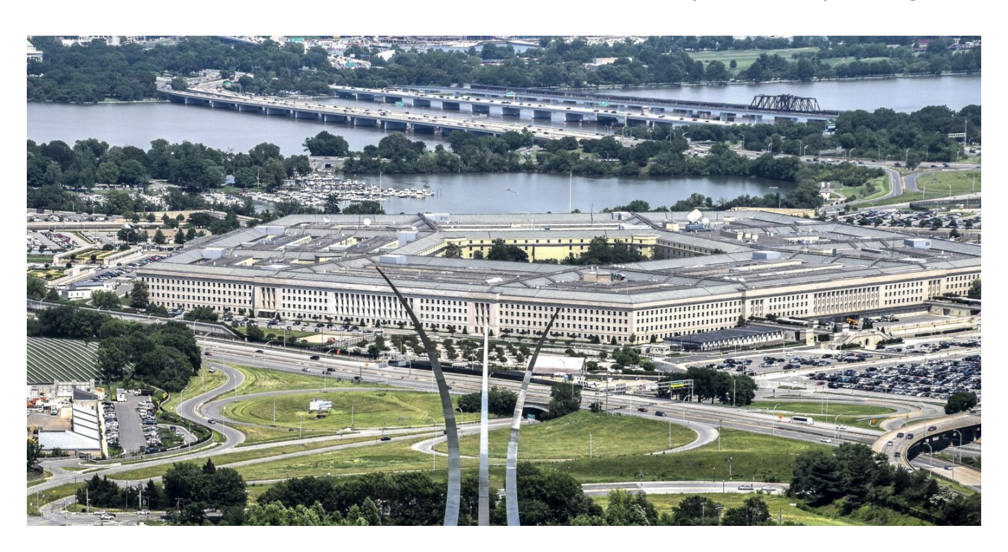
The Pentagon has big work ahead of it in 2022, with the release of a new National Defense Strategy planned for early next year.

A Russian invasion of Ukraine could derail the Defense Department's planning.