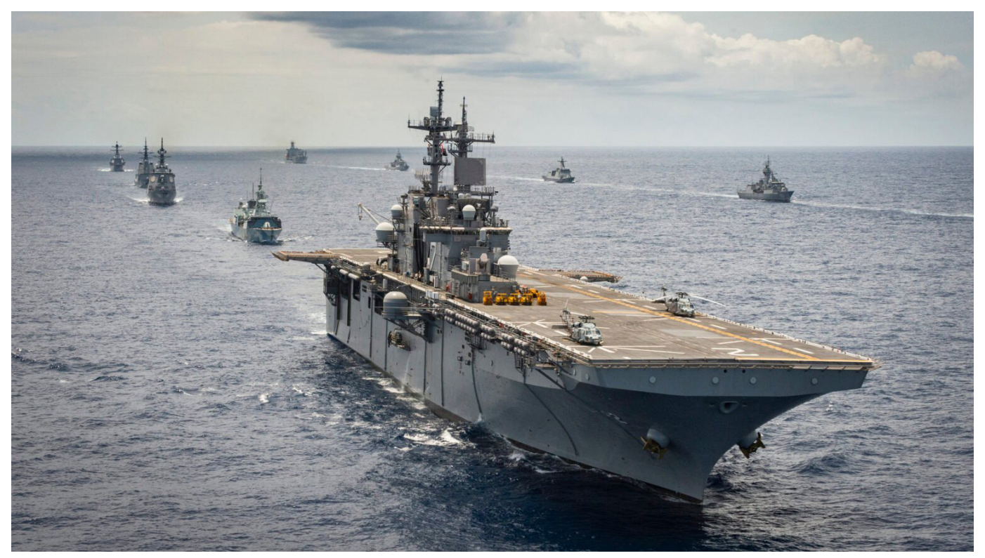
Multinational navy ships and a submarine steam in formation during a group sail off the coast of Hawaii during RIMPAC 2020. (File)

Expect the political battle over the island nations like Fiji or the Solomons to be a big part of Chinese-American geopolitics in the new year.