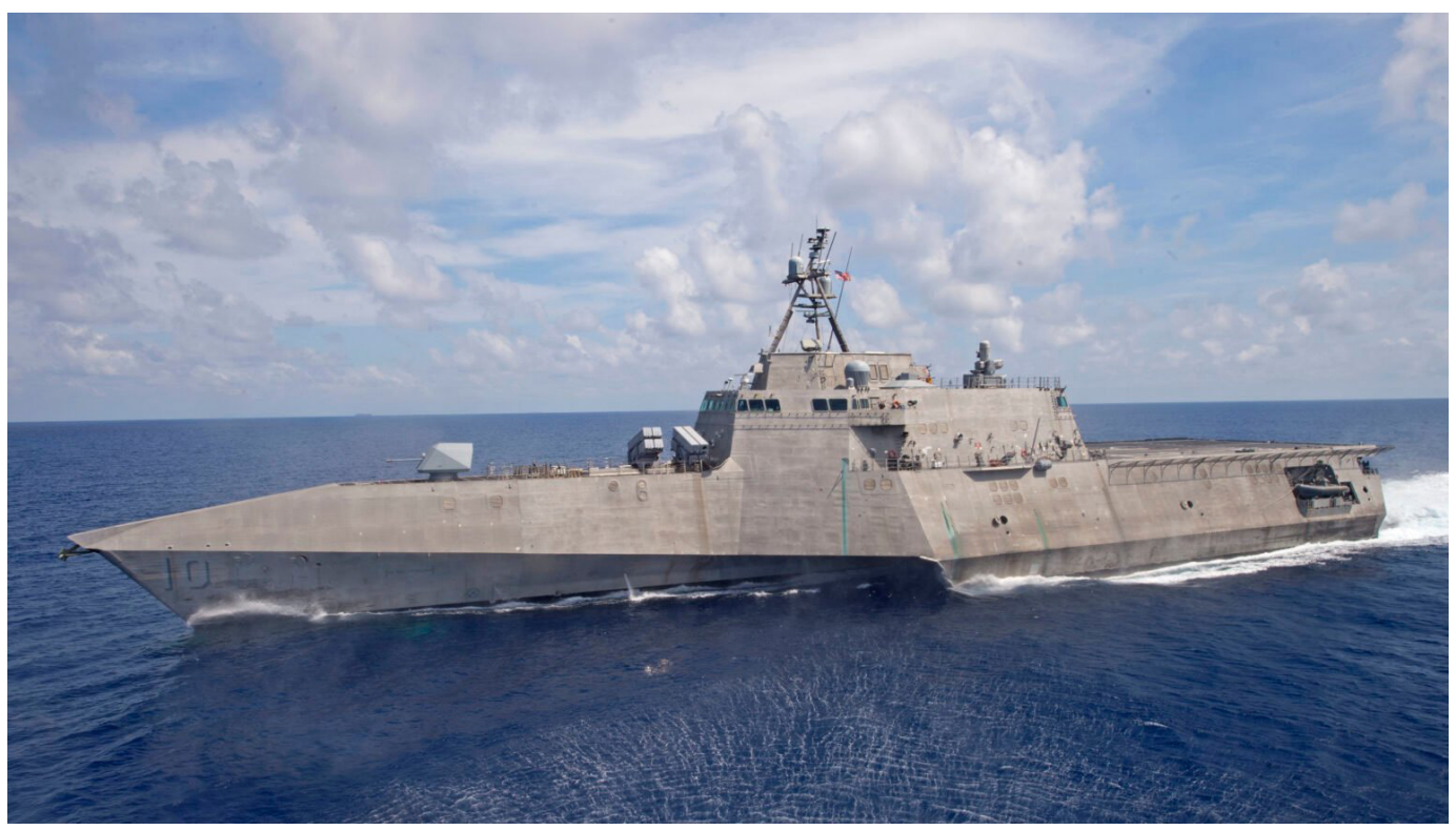
The Gabrielle Giffords (LCS 10) patrols in the South China Sea in 2020 with the Naval Strike Missile mounted.

The Pentagon has long talked up its pivot to the Indo-Pacific. What does that actually look like?