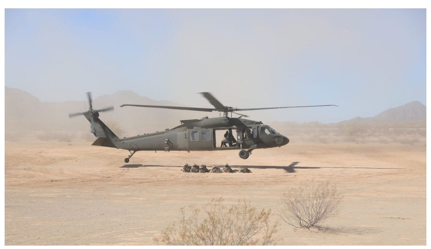
Soldiers from the 82nd Airborne Division take part in an IVAS-enabled air assault exercise on Nov. 3, 2021, on Yuma Proving Ground, Arizona, as part of Project Convergence 21.

New capabilities that will transform an Army balancing tight budgets in 2021.